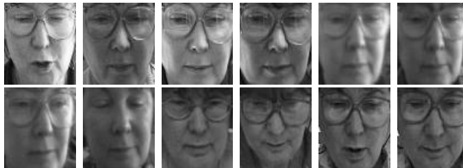
Figure 1: First frame of the 12 sessions of the BANCA database.

As stated in the introduction, we are interested in evaluating the performance of the monomodal and the multimodal algorithms at different user template sizes. While this template is relatively small for the face modality, it can be very large for the speech modality, mainly because of the large number of Gaussians that are necessary to represent faithfully the probability densities. For the face modality, the user template size is determined by the LDA subspace dimensionality. The LDA basis vectors, solution of (1), are ranked according to the magnitude of their corresponding eigenvalue. This magnitude is an indicator of the discriminatory power of the corresponding eigenvector. The performance of the face verification algorithm is then assessed at various numbers of LDA basis vectors, by gradually removing the less discriminative ones.