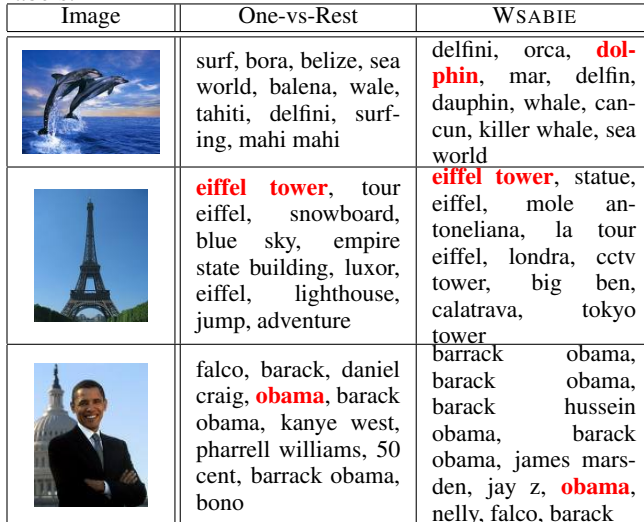
Table 8: Examples of the top 10 annotations of three compared approaches: PAMIR IA , One-vs-Rest and WSABIE, on the Web-data dataset. Annotations in red+bold are the true labels.

do not have space to describe it here. Overall, we believe the performance of our method actually gives a practically useful system.