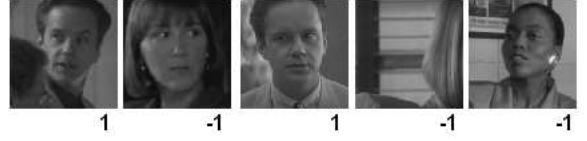
Figure 1. Some Images of the Database

approach. Two types of invariant transformations were studied: rotations (5) and scalings (6).