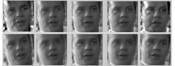
Figure 2. Two Types of Virtual Images.

tained by applying direct calculation of tangent vectors according to (5). We can thus see that despite the accurate tuning of Gaussian filtering and other “tricks”, only very local rotations are reasonable.